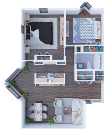
E 889 SQ FT