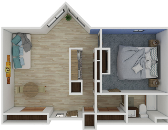
D 771 SQ FT