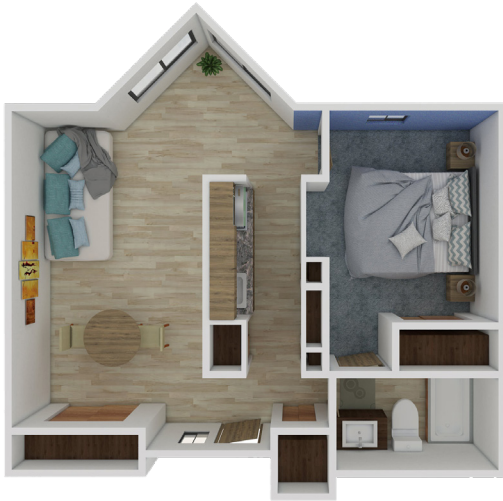
A 584 SQ FT

Solstice Senior Living at Guilford offers several floor plan choices to suit your needs.