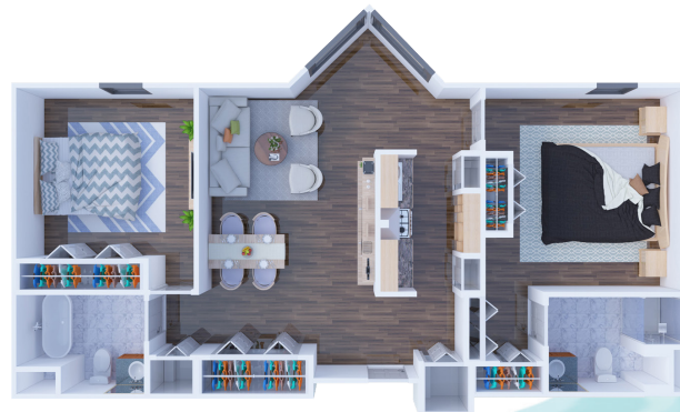
F 958 SQ FT

Solstice Senior Living at Guilford 201 Granite Road, Guilford, CT 06437 (855) 843-8041 SolsticeSeniorLivingGuilford.com