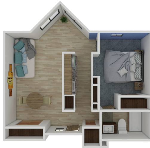
C 628 SQ FT